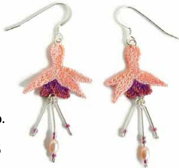
Earrings Length: 42mm. incl drop. Sterling silver earwires ..... £18.95