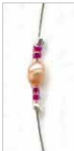
Peach Necklet wire detail