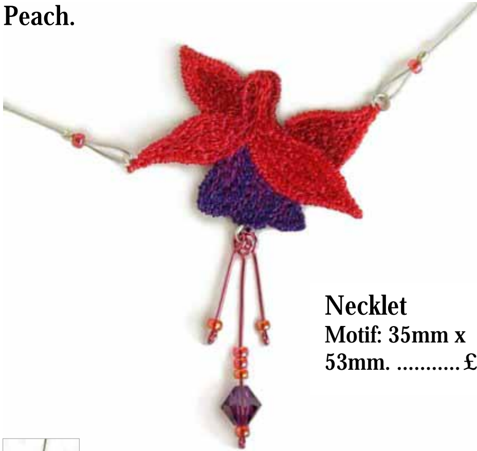
Necklet Motif: 35mm x 53mm. .... £16.95

One of the most popular garden flowers, these are available in vibrant Fuchsia Red and a more subtle Peach.